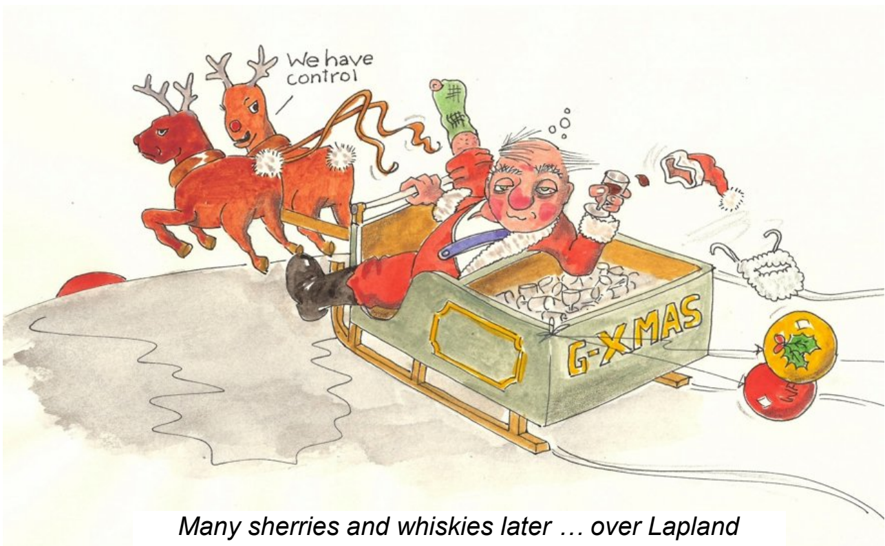
Many sherries and whiskies later ... over Lapland

Happy Christmas to all our members, staff and friends